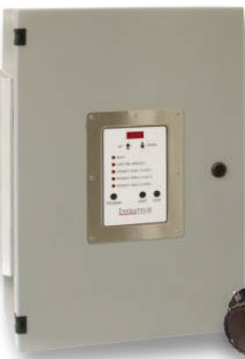
Simple, cost effective Input Regulators